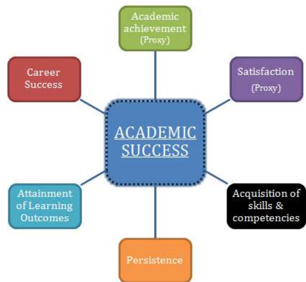
Figure 2. York, Gibson, & Rankin Revised Conceptual Model of Academic Success

A revised definition and model. It is with this critique in mind that we present an amended definition and conceptual model of academic success (Figure 2). Based on our findings we define academic success as inclusive of academic achievement, attainment of learning objectives, acquisition of desired skills and competencies, satisfaction, persistence, and post-college performance.